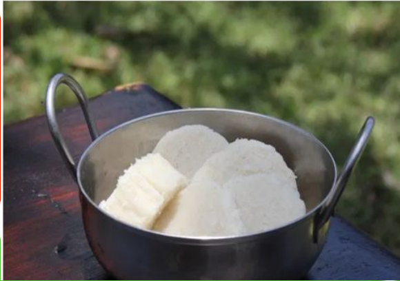
UGAL (White Maize Meal) A thick porridge