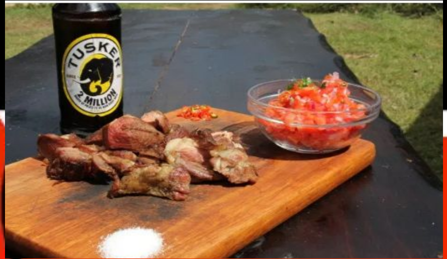
NYAMA CHOMA (lamb or goat)

It goes down well with a Tusker (Kenyan beer)