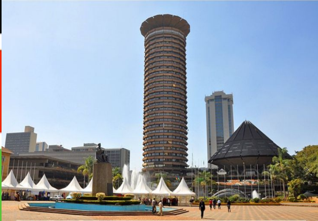
Kenyatta International Conference Centre

You can go up to the rooftop viewing platform and admire panoramic views over Nairobi ,or enjoy a meal at one of the restaurants.